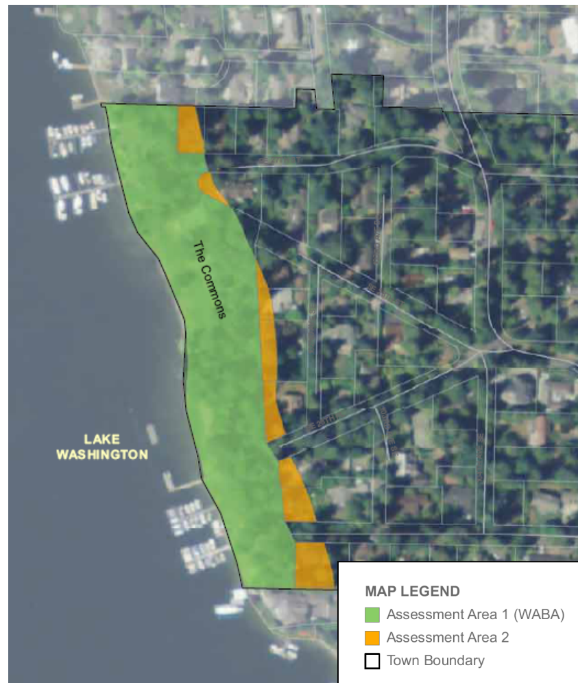
Figure 1. Beaux Arts Village Shoreline Reaches